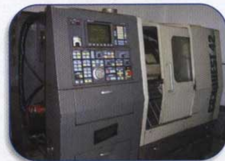
Hardinge 3 AXIS CNC Lathe Machine with Live Tooling