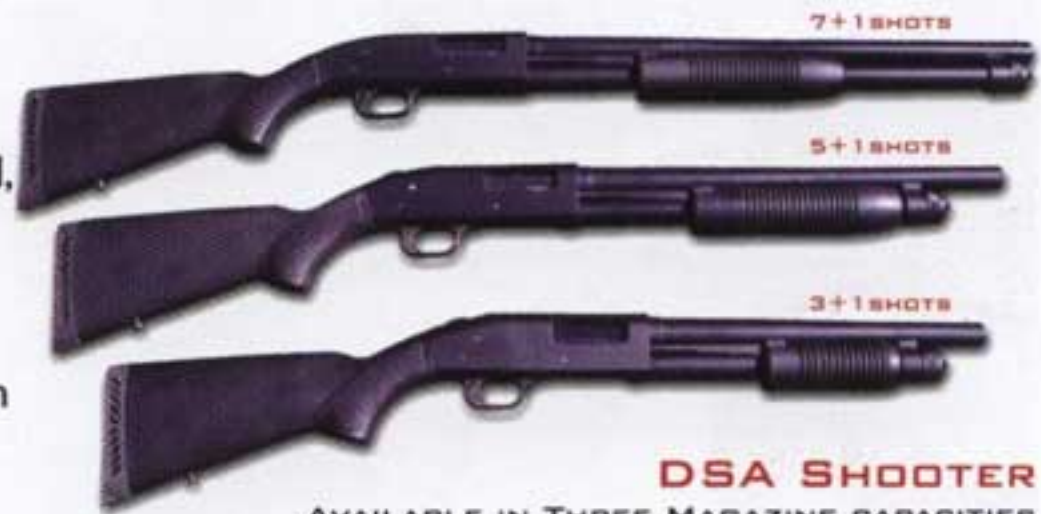
DSA SHOOTER AVAILABLE IN THREE MAGAZINE CAPACITIES FOR USE WITH HIGH POWER CARTRIDGES (NITRO - PROOFED)