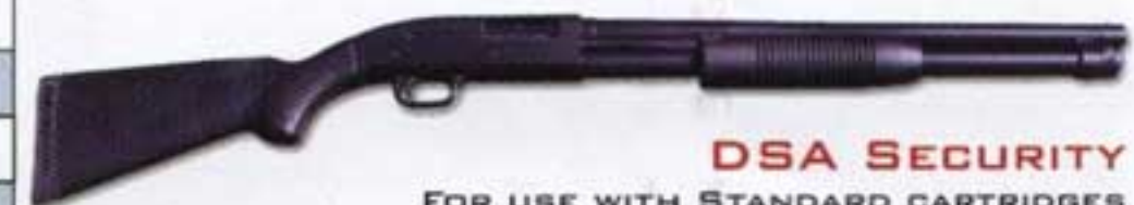
DSA SECURITY FOR USE WITH STANDARD CARTRIDGES AVAILABLE IN THREE MAGAZINE CAPACITIES (NON NITRO-PROOFED)

All Parts of DSA 12 Bore Pump Action Shotguns Are Completely Interchangeable