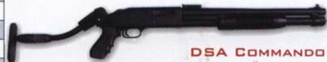
DSA COMMANDO FOR USE WITH HIGH POWER 3" CARTRIDGES AVAILABLE IN THREE MAGAZINE CAPACITIES (NITRO-PROOFED)