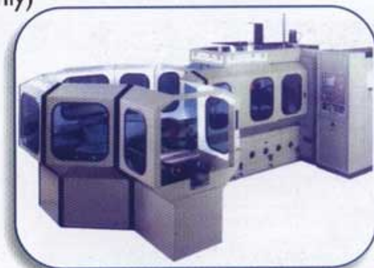
WAHLI W53 4 AXIS CNC Horizontal Machining Center