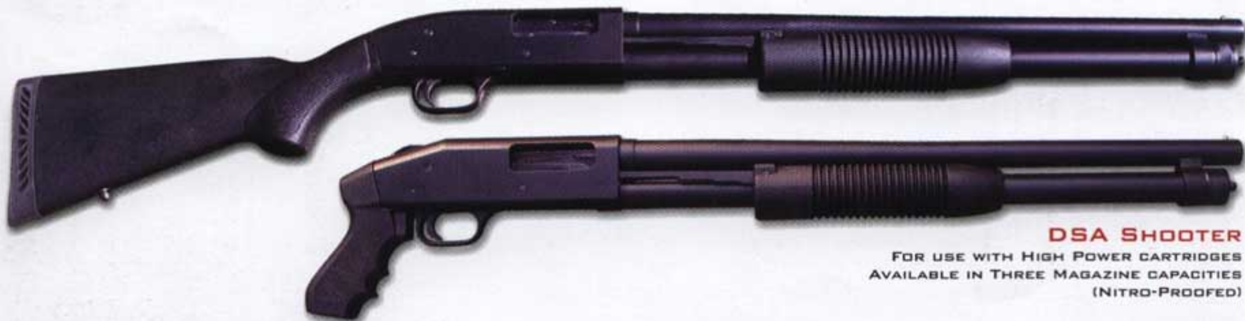
DSA SHOOTER FOR USE WITH HIGH POWER CARTRIDGES AVAILABLE IN THREE MAGAZINE CAPACITIES (NITRO-PROOFED)

All Parts of DSA 12 Bore Pump Action Shotguns Are Completely Interchangeable