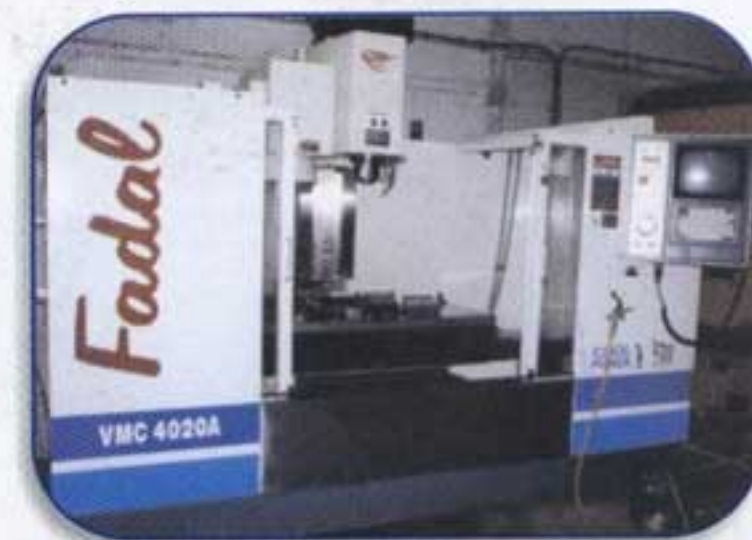
88HS 4 AXIS CNC Vertical Machining Center